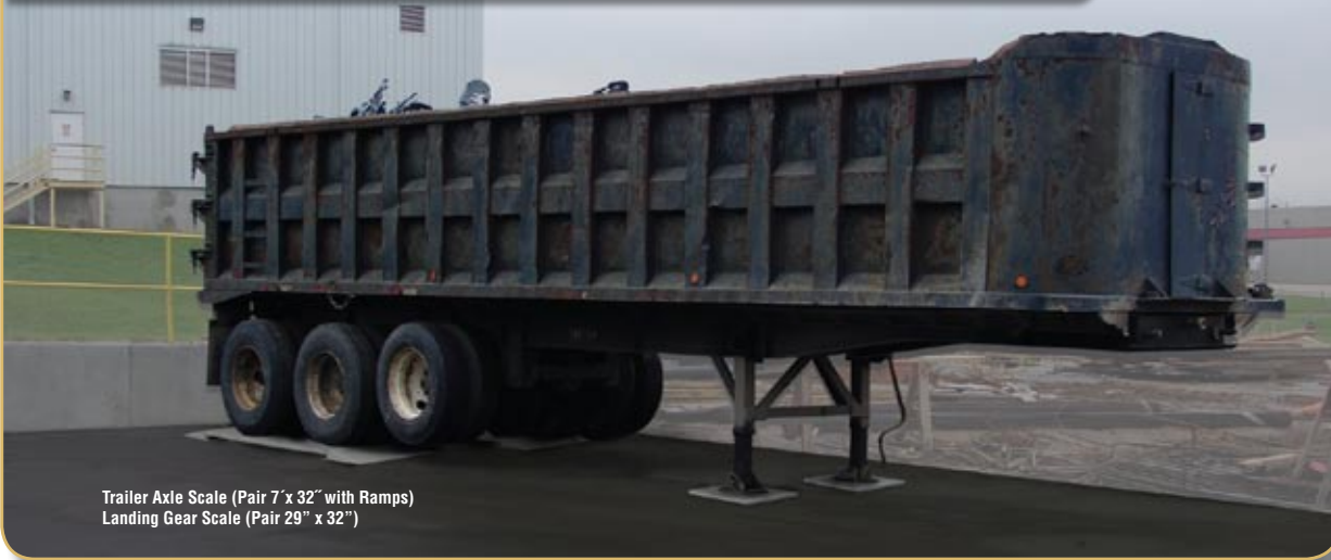
Trailer Axle Scale (Pair 7' x 32" with Ramps) Landing Gear Scale (Pair 29' x 32")