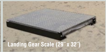
Landing Gear Scale (29" x 32")